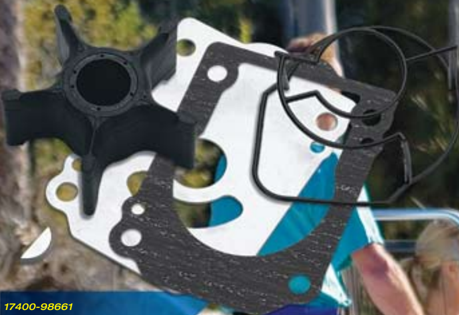
17400-98661 water pump repair kit