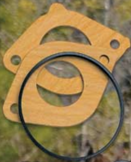
13910-89J01 carburetor repair kit