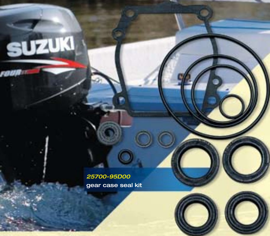
25700-95D00 gear case seal kit